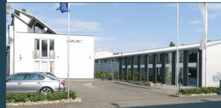
One of our 17 offices and meeting rooms

Our company building in Münster and our conference center SMC right next door